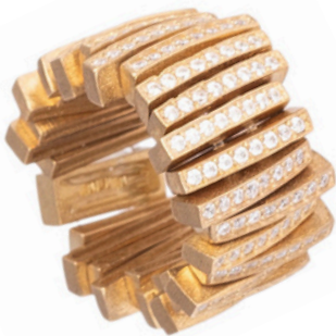
CRS-2001 € 62