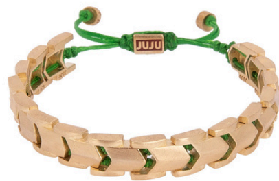
CCB-1989 € 101