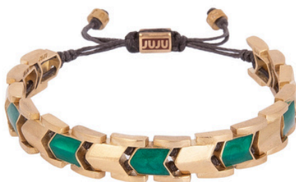
CBM-1988 € 139