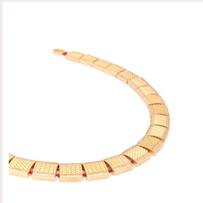
CNS-1999 € 187