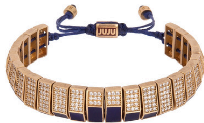
CBM-1991 € 139