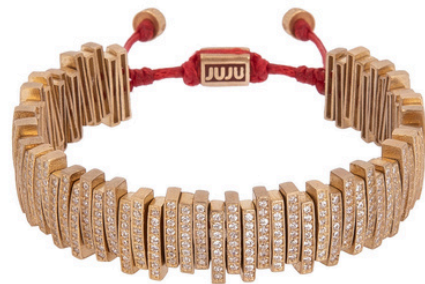
CBS-1997 € 132