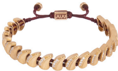
CBS-1973 € 91