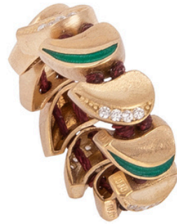
CRM-2003 € 62