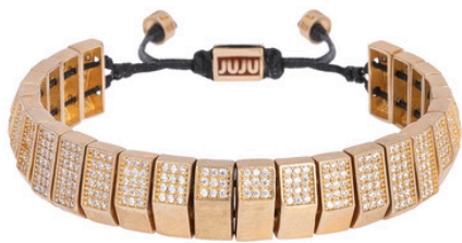
CBS-2019 € 139