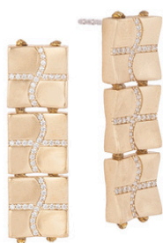
CES-2011 € 67