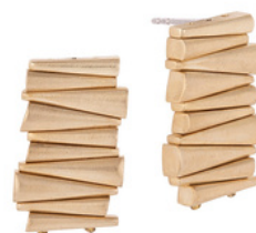
CCE-2010 € 77