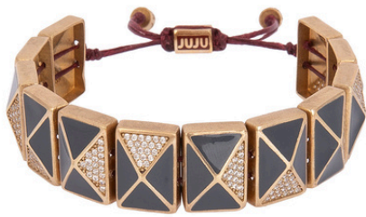
CBS-1975 € 154