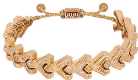
CBS-1982 € 132