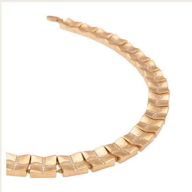
CNS-1998 € 187