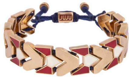
CCB-1968 € 132