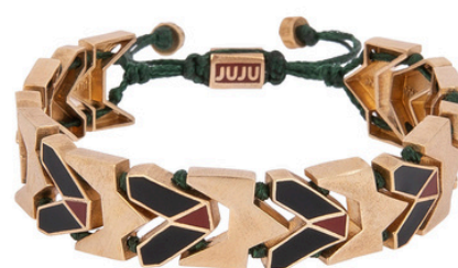
CCB-1967 € 132