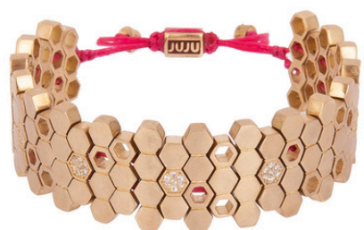
CCB-1966 € 139