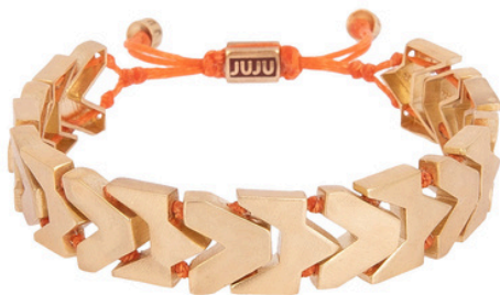
CCB-1970 € 91