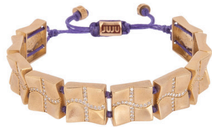
CBS-1981 € 132