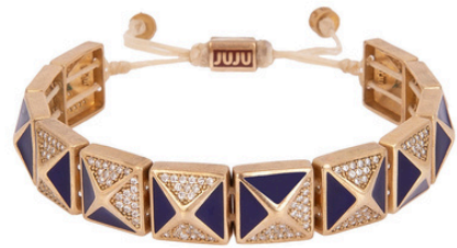
CBS-1976 € 132