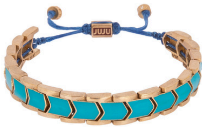
CBM-1990 € 139