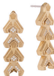
CES-2006 € 58