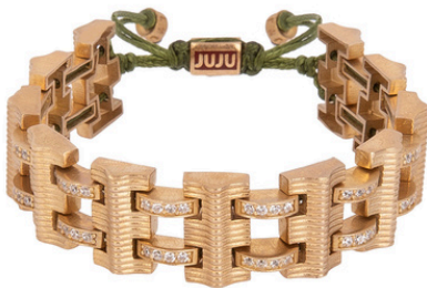
CBS-1992 € 132