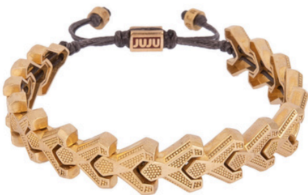
CCB-1984 € 91