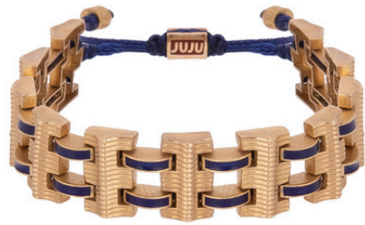
CBM-1993 € 154