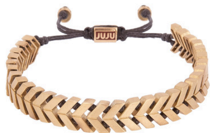
CCB-1996 € 101