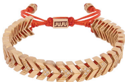
CBS-1995 € 166