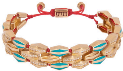
CBS-1979 € 139