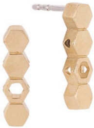
CCE-2013 € 19