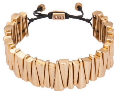
CCB-1965 € 139