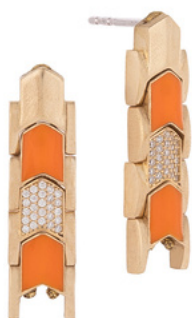
CEM-2009 € 67