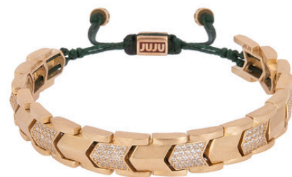
CBS-1986 € 166