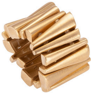
CCR-2004 € 91