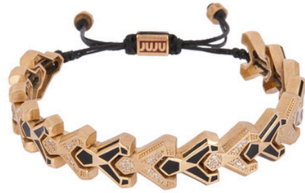
CBM-1985 € 139