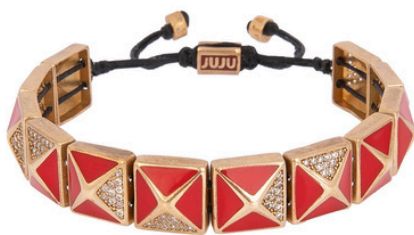
CBS-1977 € 124