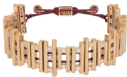
CBS-1964 € 132