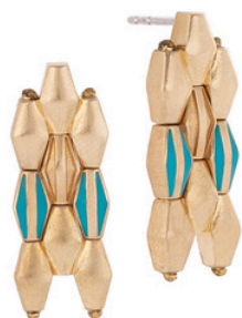
CEM-2005 € 58