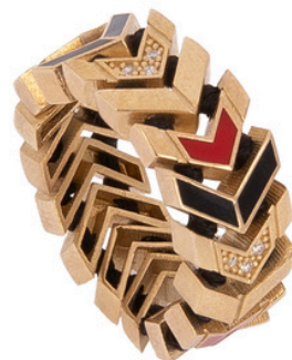
CRM-2002 € 62