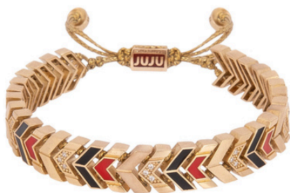
CBM-1994 € 124