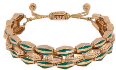
CBS-1980 € 139