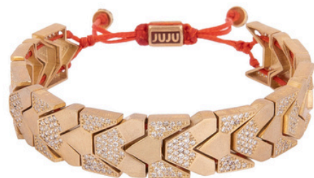
CCB-1971 € 132