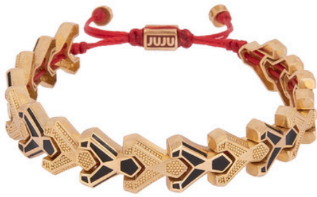
CBS-1973 € 91