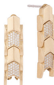
CES-2012 € 67