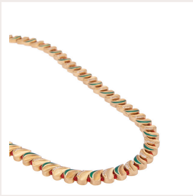
CNE-2000 € 187