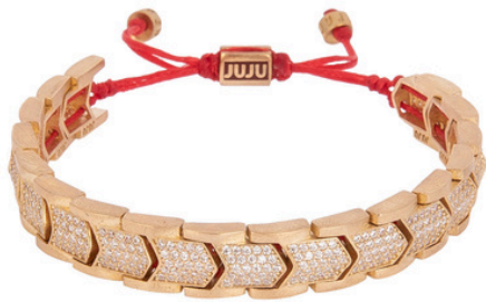
CBS-1987 € 132