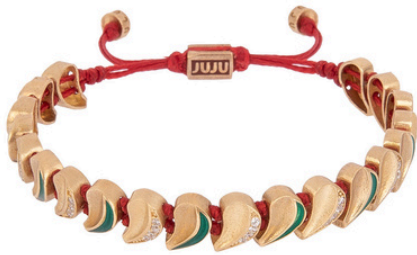
CBM-1972 € 101