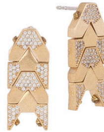
CBS-2014 € 67