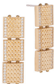
CES-2007 € 67