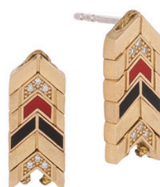
CEM-2008 € 53