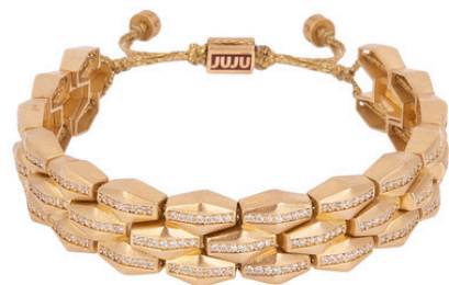
CBS-1978 € 166