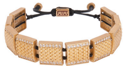
CBS-1974 € 132