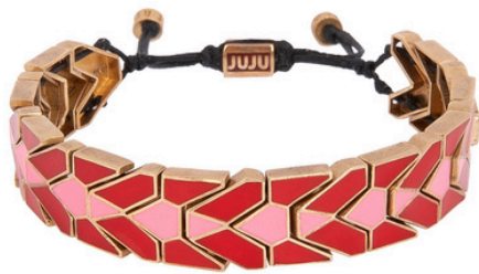
CCB-1969 € 139